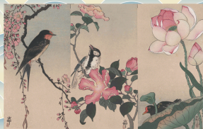
燕と桜 四十雀とサザンカ 蓮と鶴 Ohara Koson Around 1965