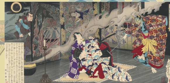
Tsukioka Yoshitoshi 偽紫田舎源氏 1882

This is the art work by Tsukioka Yoshitoshi who is a stepfather of Tsukioka Kōgyo. This is the one scene on "Nise-murasaki Inaka Genji" which based on "Genji Monogatari (the Tale of Genji)" and created in Edo period.